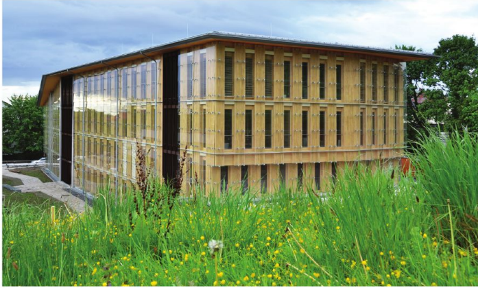
Drained and back-ventilated glass rainscreen features horizontally and vertically overlapping safety laminated glass panels at this 1300-m 2 (14,000-sf) commercial building in Freiburg, Germany.