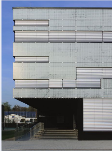
Drained, back-ventilated rainscreen system features white fritted glass at Sebastian Lotzer Secondary School in Memmingen, Germany.